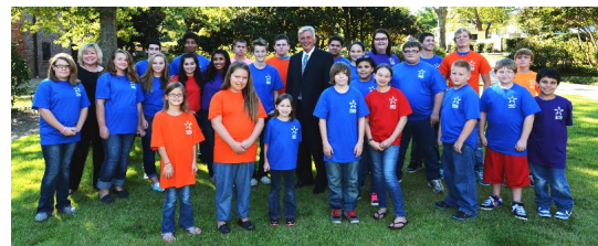
Arkansas Sheriffs Ranch Children Visit the Governor's Mansion September 23

Governor Beebe has served as Master of Ceremonies and presented the Arkansas Children's Award for the past 18 years and this year will receive the award himself. This year's dinner will honor Governor Beebe for his more than 32 years of public service to the people of Arkansas as well as his many years of support of the boys and girls at the Arkansas Sheriffs' Youth Ranches. 100% of the proceeds from the dinner will benefit the Ranch.